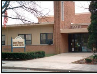
Saint Paul School