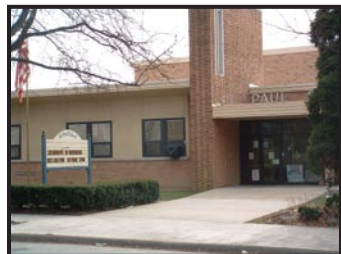
Saint Paul School