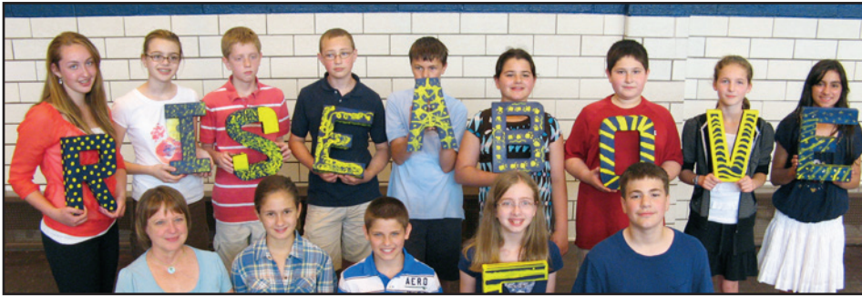
2012 St. Paul Graduates