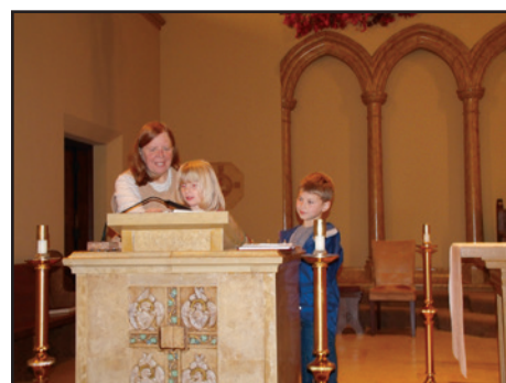
Learning to lector at a young age