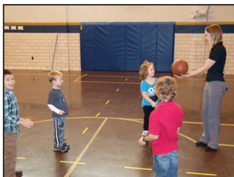
Play time for preschoolers